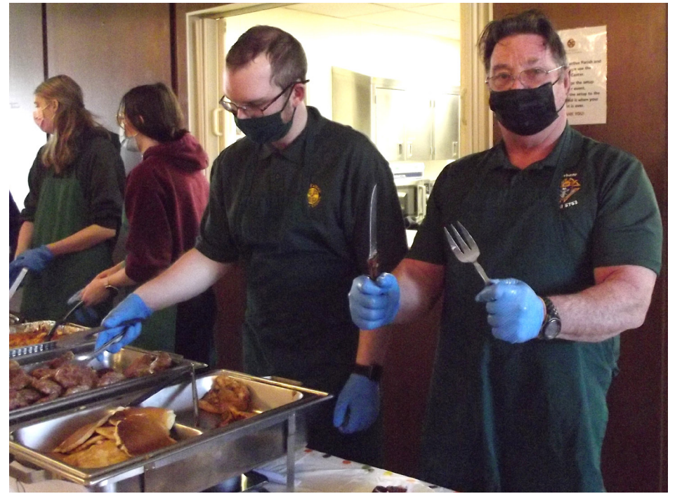
The Knights serve plenty of food at the Mardi Gras breakfast.

The Urbana Knights have worked with Champaign Council #891 on St. Mary's Cemetery maintenance projects, and typically participate in the Champaign council's annual