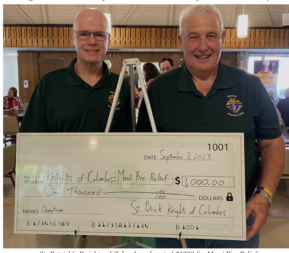
St. Patrick's Knights of Columbus donated $1000 for Maui Fire Relief.

begun hosting the Sunday morning Coffee Shop on the first Sunday