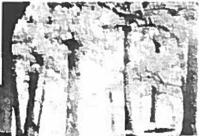
Renewing friendships and starting new ones at annual parish picnic, Crystal Lake Park.