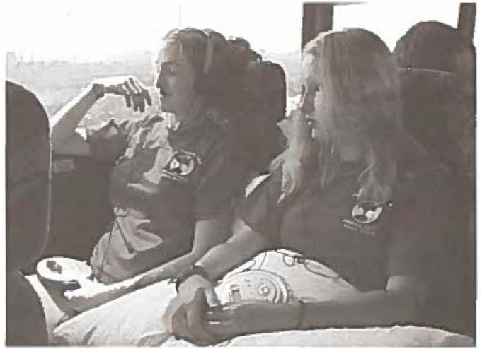
On the road!

I'm diving in, going in deep over my head... I want to be caught in the rush, lost in the flow... The water's deep, wide, alive—sink or swim, I'm diving in!