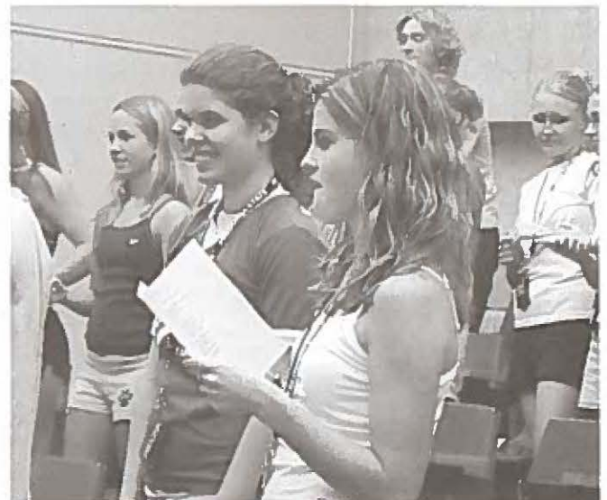
After work, some r&r and then evening worship