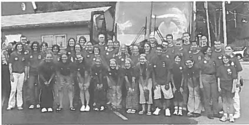
The 2003 CREW participants ready to leave on the 2003 mission

Go, therefore, and make disciples of all nations, baptizing them in the name of the Father, and of the Son, and of the Holy Spirit, teaching them to observe all that I have commanded you. And behold, I am with you always, until the end of the age. (Mt 28:19-20)