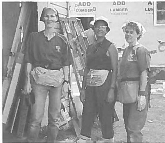
Smile while you work!

Water mingled with wine in becoming Christ's blood at Mass, where we reflected on the value of forgiveness, instant forgiveness. After the day's hard work we especially enjoyed washing up in the showers, always a perfect temperature.