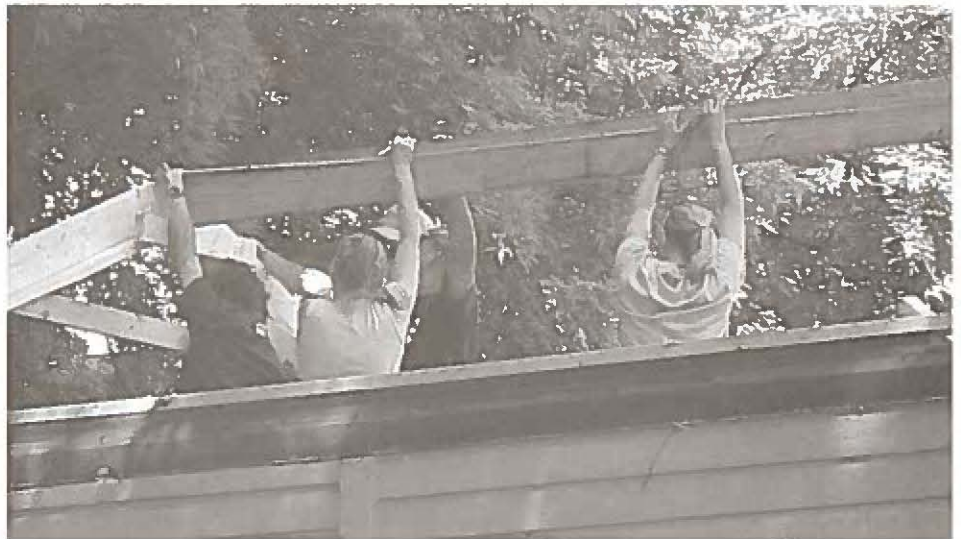
Setting the ridge board

"I really liked the presentation by the Seneca Nation when they danced and sang and let us dance too. It was nice to learn about another culture and share and learn from them."