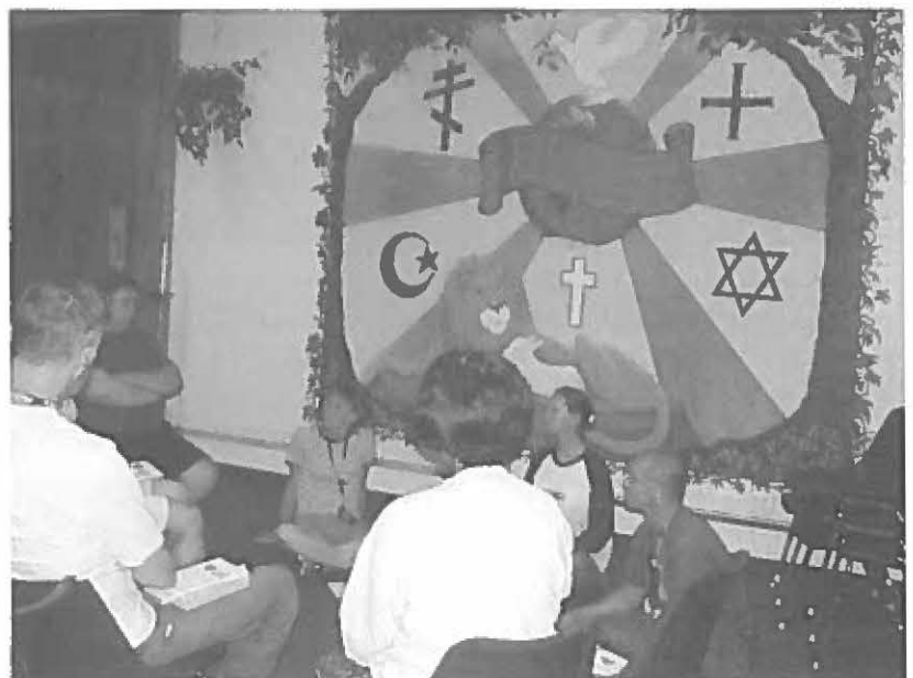
Sponsors and Father Patrick at Bible Study