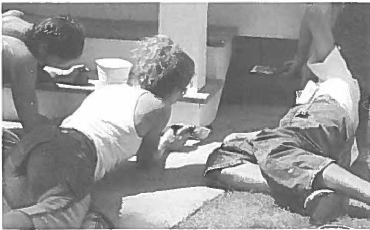
Painting in tight spaces

There is a supernatural power in water. It can bring the dead to life, it can fill an empty soul... But we'll never know the awesome power of the grace of God unless we let ourselves be swept away into the water of God's life.