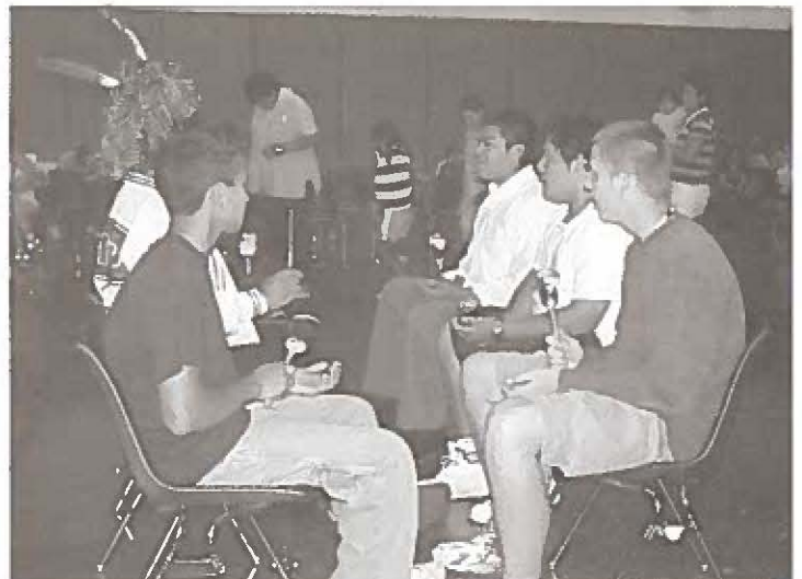
Seneca Culture Camp and Iroquois Social