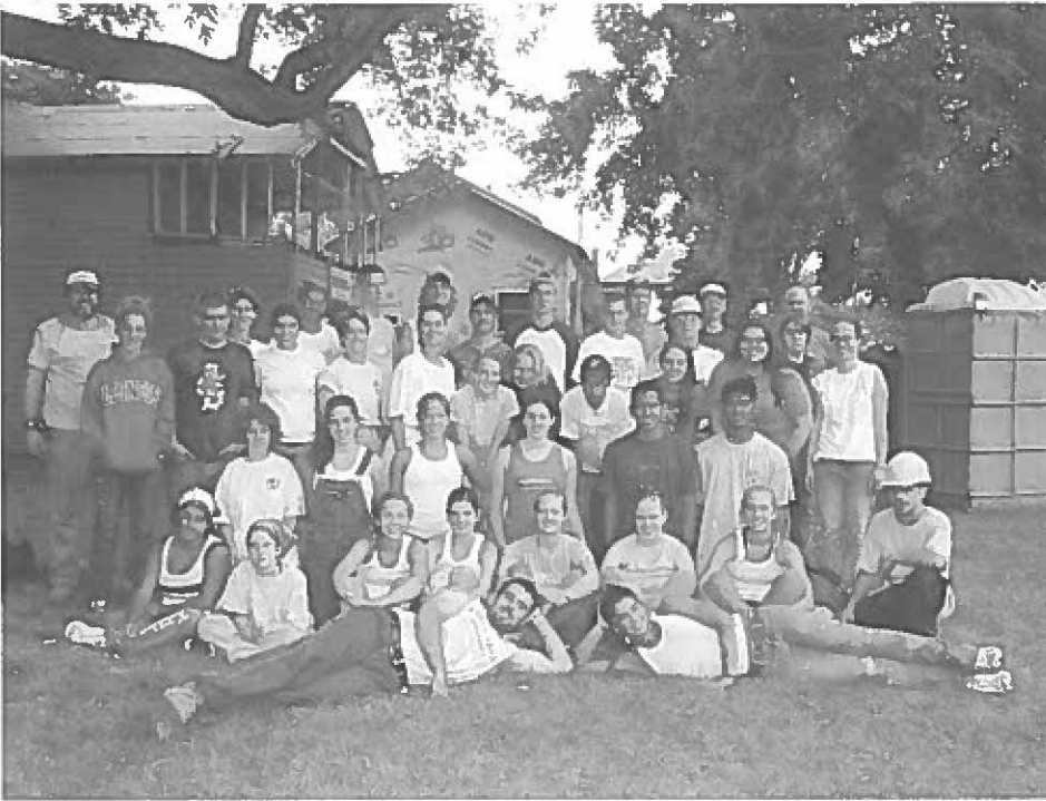
CREW 2003 mission accomplished!