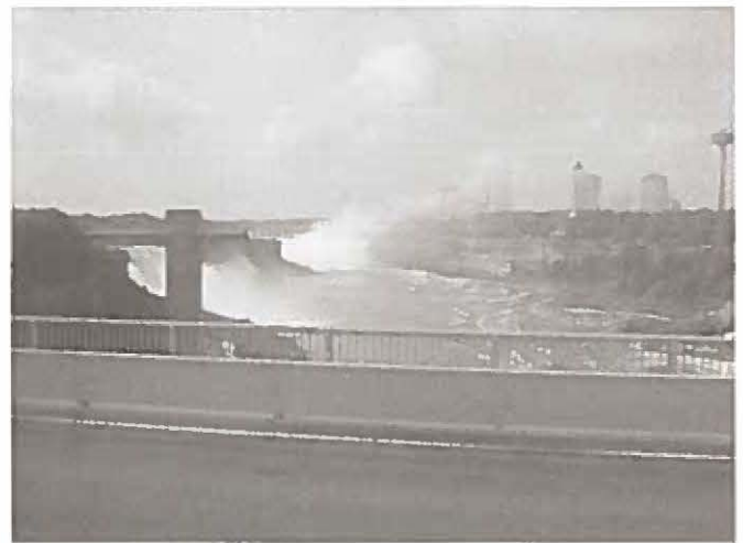
CREW at Niagra Falls