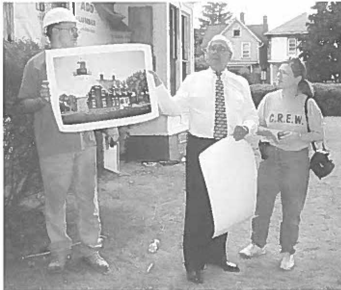
The Mayor of Dunkirk and the director of Youth Build Dunkirk make a presentation to CREW '03