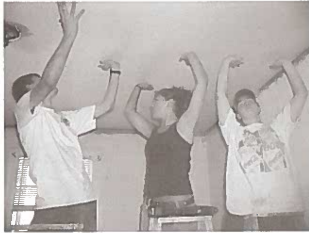
Working on the ceiling.

Throughout the whole week they had constantly been fighting and yelling at each other, but when they saw the work we were doing, it did something to them, and they were able to reconcile their differences. Seeing them happy and nice to each other made all the toil worth it. I strongly recommend that anyone who is thinking of coming on [next] year's mission go. It is an experience that you cannot possibly get from anything else.