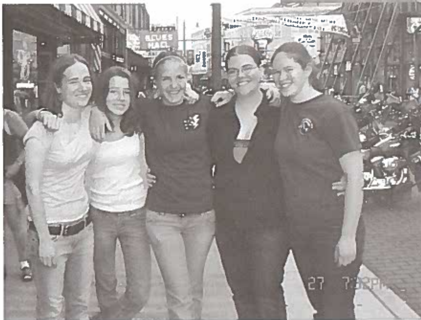
Having fun in downtown Memphis