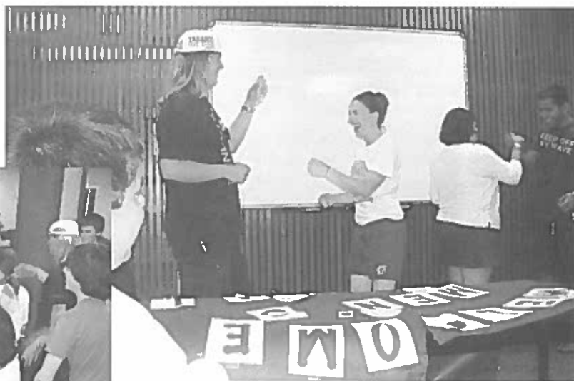
Evening worship called for pretty active participation!