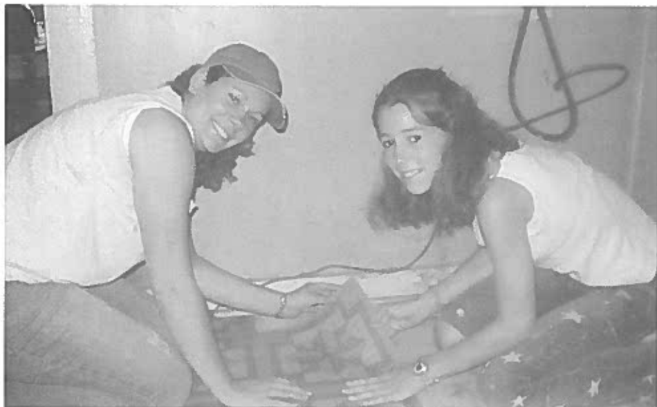
Laying a new floor was hard work, but we had fun doing it!

this, so that you could not even tell where the floor was.