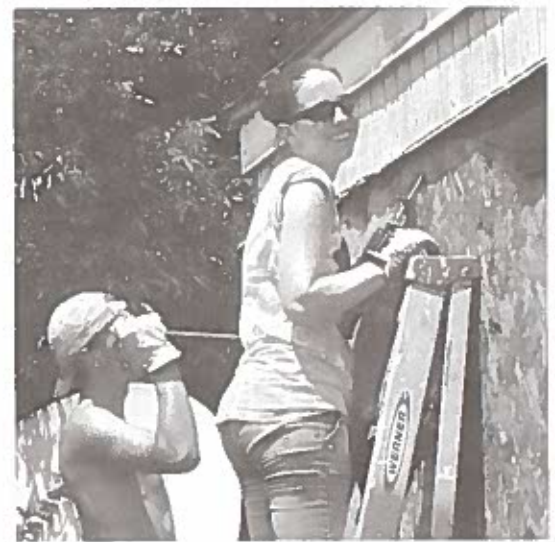
Working in the heat was just another challenge!