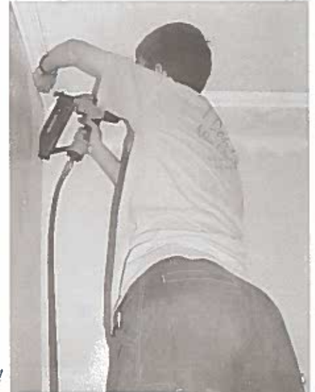
We got to use some really cool tools!