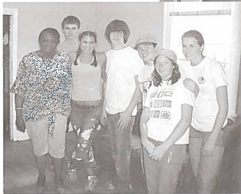
The tree is gone and the ceiling looks great!

This was my fourth Mission trip with St. Patrick's CREW. The one thing that sticks out really well in my mind about the trip this year was the human interaction, especially