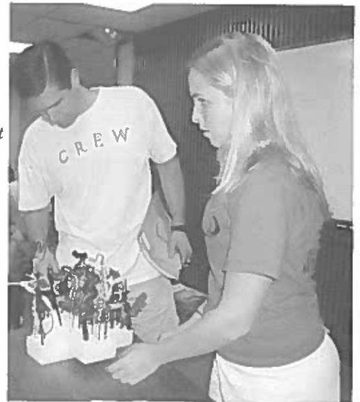
Bible study sessions were very creative.

"I liked Bible study because the discussions were very insightful."