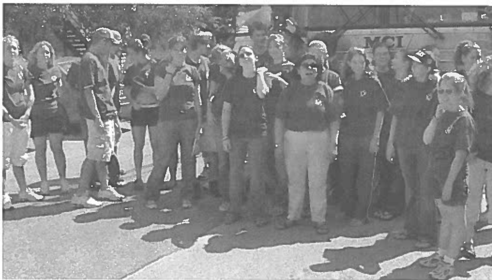
The 2005 CREW participants ready to leave on the 2004 mission

The next day the teens and parents were divided into five work groups, each of which had its own mission for the week. Four of these groups worked on home repairs for disadvantaged eld-