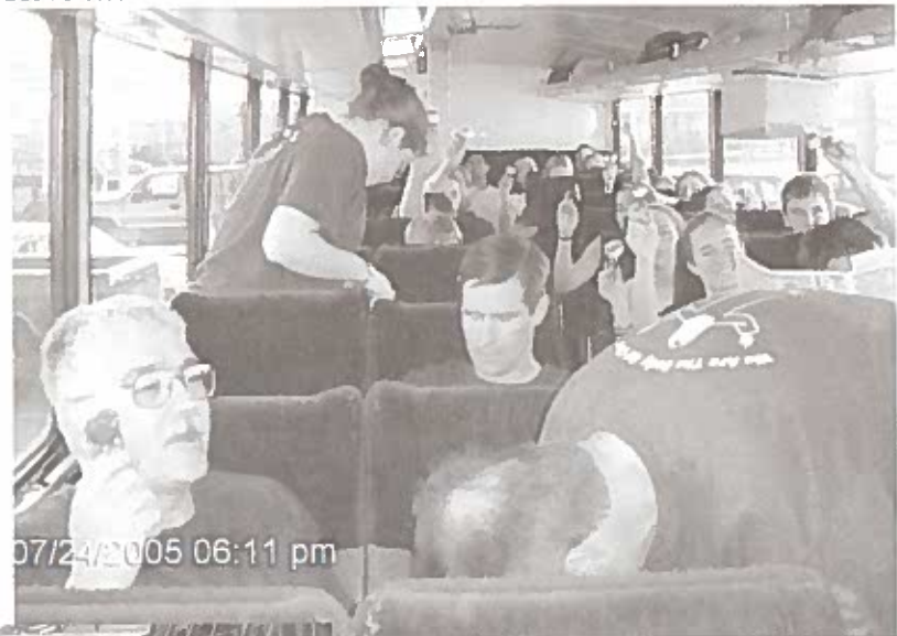
We baked in the bus, but managed to stay in good spirits