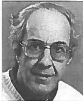
Henri J.M. Nouwen

Copies of the paperback book (for purchase) and the reflection guide (free) will be available at the first meeting on Sunday, April 6, at 1:30 p.m. in the multipurpose room of the parish center. Child care will be provided for this meeting and for the public lecture on May 4 at 1:30 p.m.